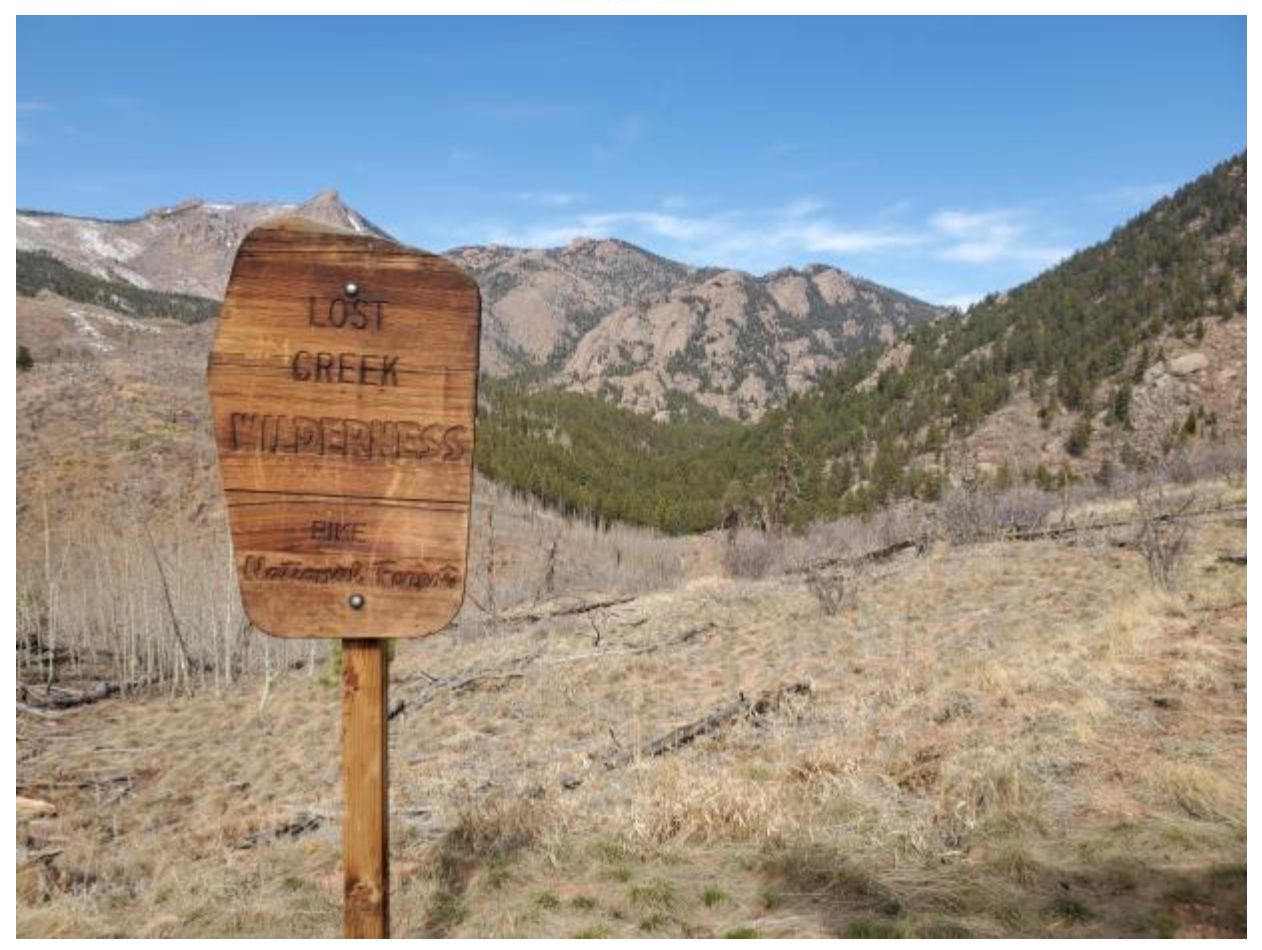
Goose Creek Trailhead, Lost Creek Wilderness, Photo by Dee Lyons April 2022