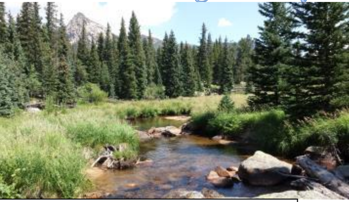
Thistle eradication in Magic Valley near Beaver Meadow Trail