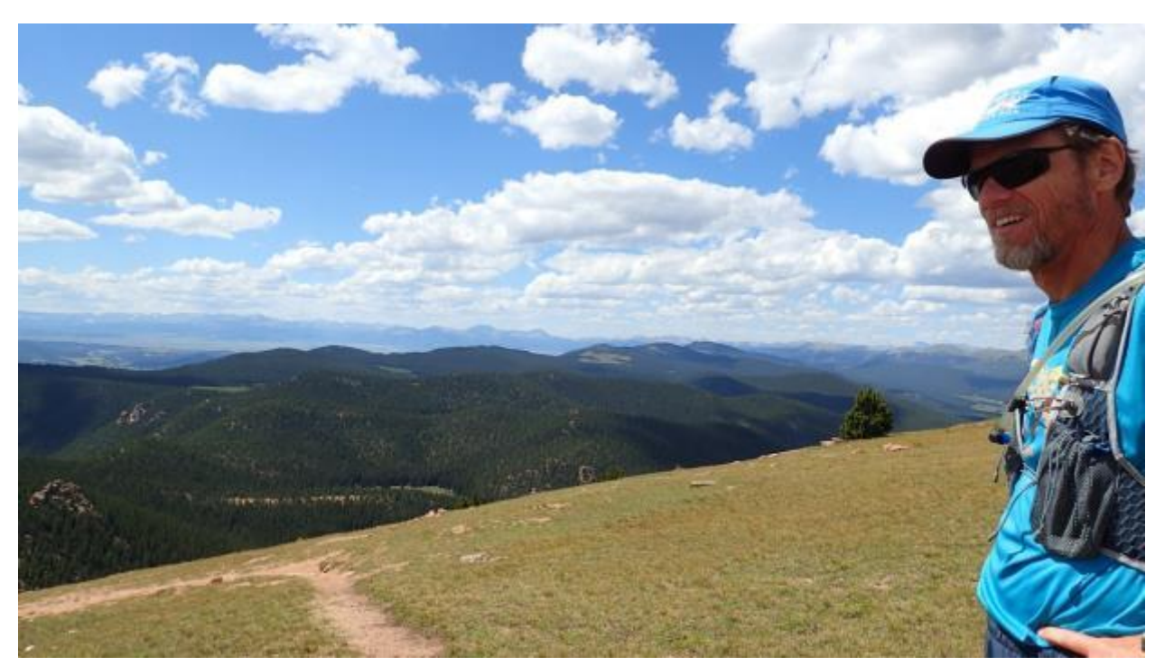
Peter on the Brookside-McCurdy trail below Bison Mountain, Lost Creek Wilderness

The high country has the look and feel of late summer – the first sparse yellow leaves are occurring on plants. I also notice the days getting shorter. There is still a lot of work to be done, lots of trails still to patrol, and we seem to be in a period where a day out is almost guaranteed to have fine weather. Please help us complete our surveys of all trails in both wildernesses. *Peter Vrolijk**