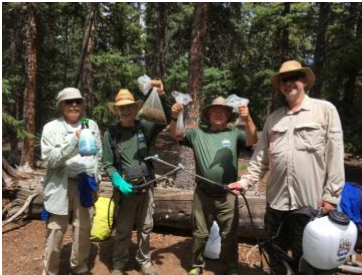
Noxious Weed Team on the warpath with Orange Hawkweed at Beartrack Lakes Trail July 27 th .

The final note for those of you with an eye noxious weeds and an urge to hike; please think about one of the Lost Creek Trails . With the ongoing comprehensive inventory of invasive species, we want as many eyes on the Lost Creek as possible over the course of the summer. I look forward to seeing on the trail. Alan