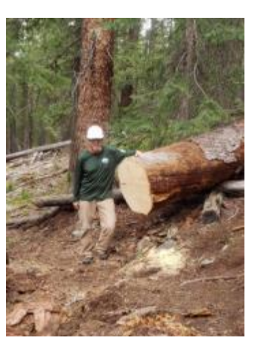
Tree Removal - The BIG One!