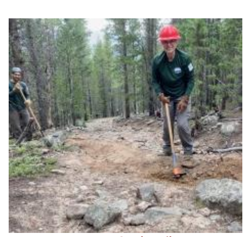
Payne Creek Trail