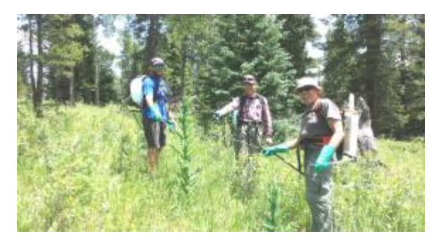
Who would ever thought that spraying weeds was actually fun!