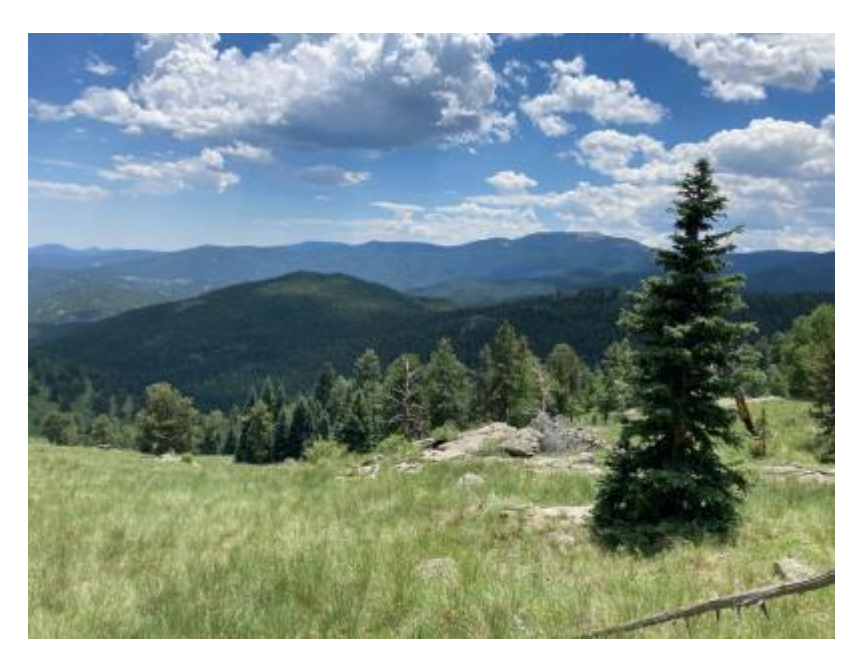
Wilderness serenity – View to the SW from the eastern end of the Captain Mtn. trail. Although substantial work was undertaken last week to treat invasive thistles in the surrounding meadows, the setting offers tremendous views.

What are we missing from this full schedule of wilderness activities? – YOU! Now is the time to realize that the summer is half done and to sign up for one of the many wilderness project opportunities. Procrastination dooms wilderness projects because of the short summer season.