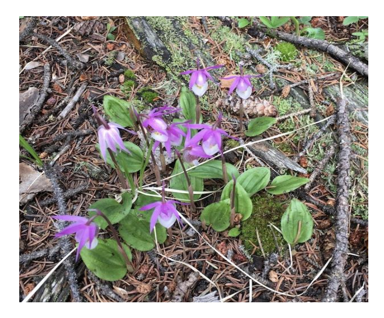
Fairy Slipper Orchid observed on the Lost Creek Trail, Mt. Evans Wilderness

We need to make observations along all trails, repair trails when possible, and engage with other wilderness users. Given that we might be unable to do all of them on any given patrol, we need to make sure that we as individuals and as a group are addressing all of the components of patrols over the course of the season. In the end, patrols should be fun and rewarding, and we achieve this by working together in the Friends Organization.