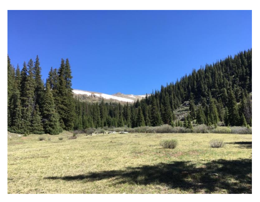
View of the Mount Evans high country from the Rosalie Trail near the Threemile Trail junction

The summer season has begun, but we are still working with the USFS to define the conditions under which volunteers can work in the wilderness areas this summer while avoiding the spread of the COVID virus through our activities. What seems almost certain is that any effort or project will be smaller than in previous years, and this in turn will require greater individual initiative from the volunteer membership.