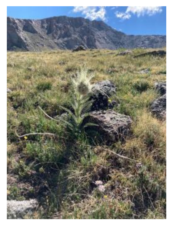
Native Mountain thistle glowing in the sunlight, on the Abyss Lake Trail, Mt Evans Wilderness July, 2020.