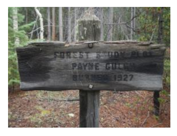
Sign marking the site of the burn