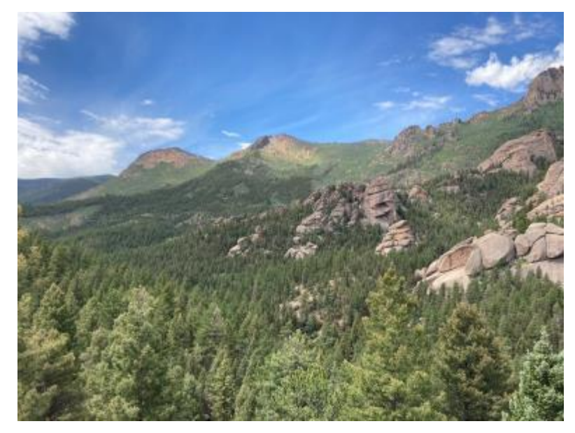
Lost Creek granite knobs viewed from the Goose Creek Trail, Lost Creek Wilderness July, 2020.

A warm spring brought the columbines out earlier than in previous years, but the hurried lifecycle of plants in the always-too-short summer of the high country created this year's unique displays of beauty. The celebration of native plants that make wilderness special enriches the soul.