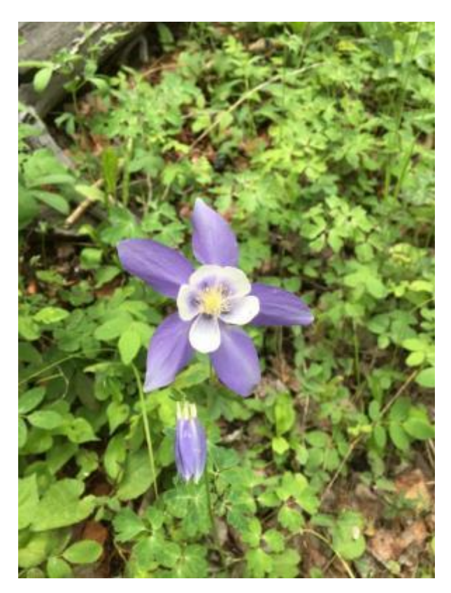
Colorado Columbine on the Ben Tyler Trail, Lost Creek Wilderness June, 2020.

A warm spring brought the columbines out earlier than in previous years, but the hurried lifecycle of plants in the always-too-short summer of the high country created this year's unique displays of beauty. The celebration of native plants that make wilderness special enriches the soul.