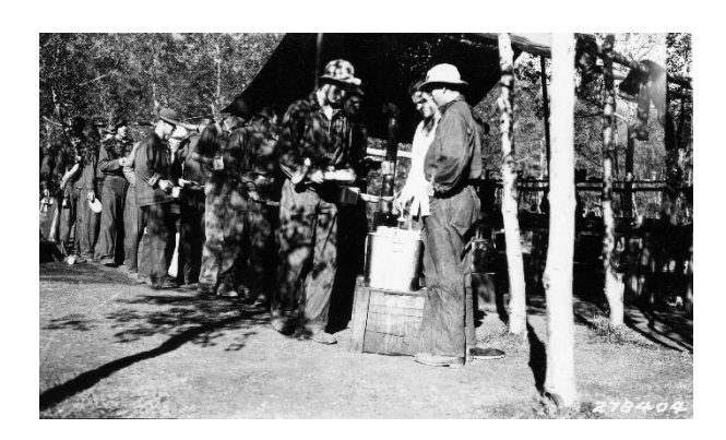
The only known photos of Camp F-10-C.

Unfortunately, information on the camp is limited, and it lasted only one season and was abandoned November 30 of that year, with Company 1814 being sent to Texas. It is possible the site was used as a side camp on occasion in later years, but it was never again a formal camp.