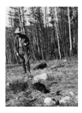
Inspecting the fire's origin