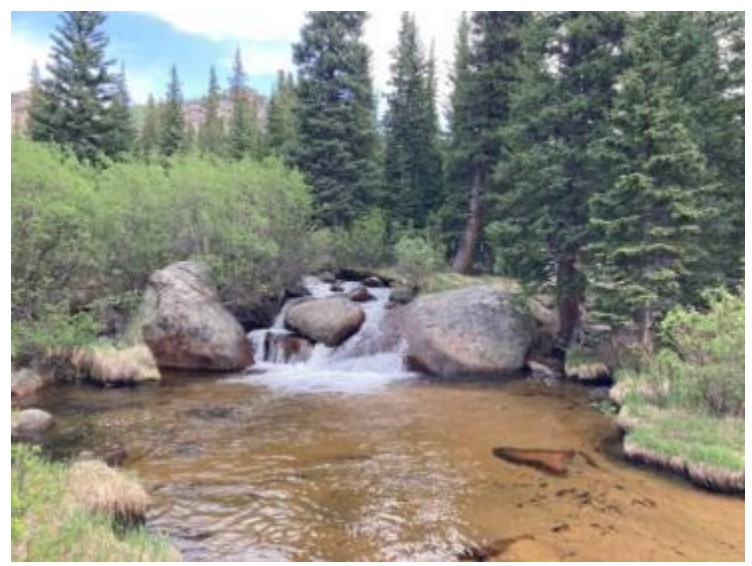
Fall reminds us that spring will follow with streams gushing with the flow of snowmelt. Bear Creek from the Cub Creek trail, Mount Evans Wilderness.

On a different note, we end the year asking our members to help as they can with year-end contributions. Regrettably, FOMELC survives solely on charitable contributions. Support from the USFS dried up a couple of years ago, and there is little evidence that this funding will ever return. We do apply for and receive grants, but