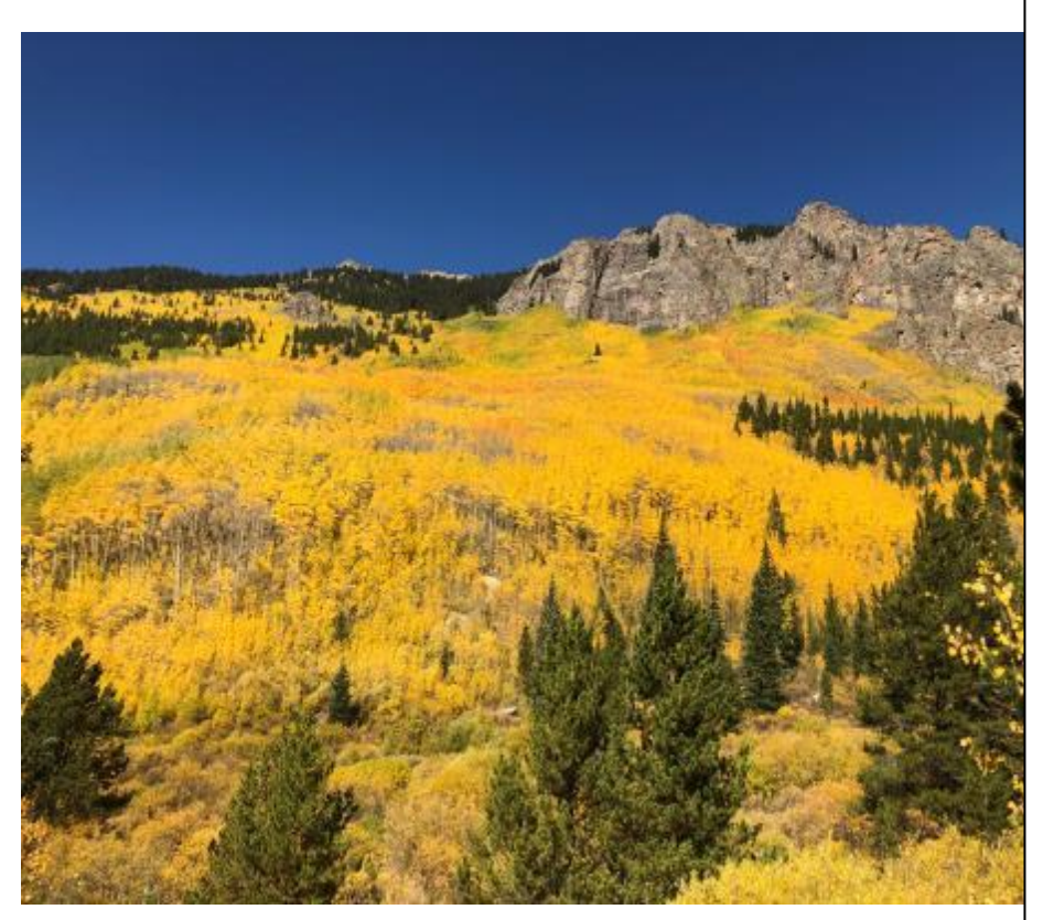
Fall colors in Mt Evans Wilderness – Abyss Lake Trail