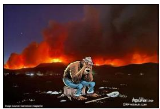
(From the Colorado Sun, imagine source Cameroon Magazine)

Closure Order and Map: https://www.fs.usda.gov/Internet/FSE DOCUMENTS/fseprd831610.pdf