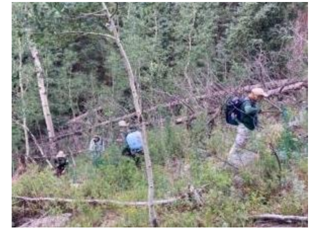
FOMELC treatment crew applying herbicide to a newly discovered Canada thistle infestation along Bear Creek during Summer, 2020.

To address the question of how we look for infestations beyond the trails, we are attempting a science-based approach that combines expert opinion about how new infestations become established and what conditions favor their growth using our existing database of observations and wilderness conditions. A novel analytical and computational approach that is being