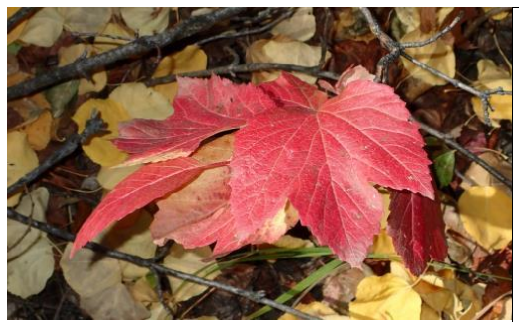
(Fall Photo by Deb Grass)