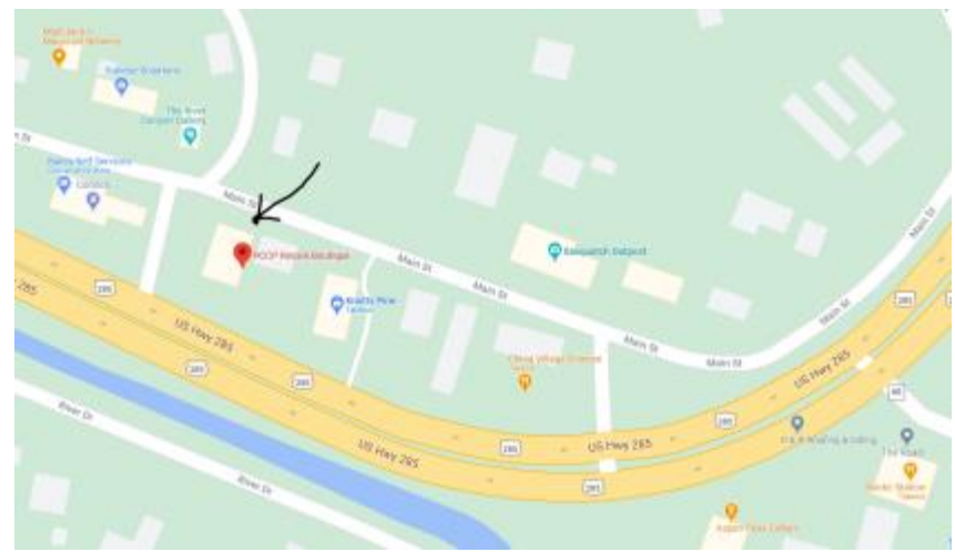
60629 US Hwy 285, Bailey, CO 80421

When you travel to the mountains on HWY285, please stop by the Resale Boutique in Bailey and help support the PCCP and FOMELC during the month of November. Look for the FOMELC display as you enter the store.