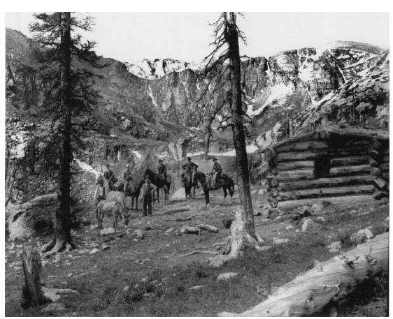
The trailside cabin. Photographer and date unknown