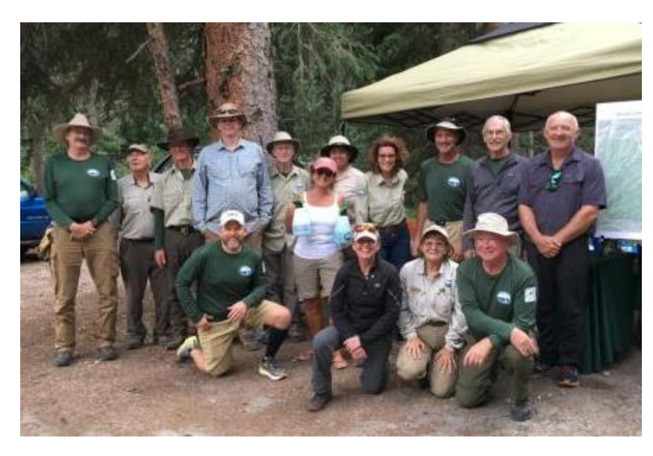
FOMELC crew participating in All-Hands Day, August 2019.

and they continue to maintain and update that site with new information. Dahl