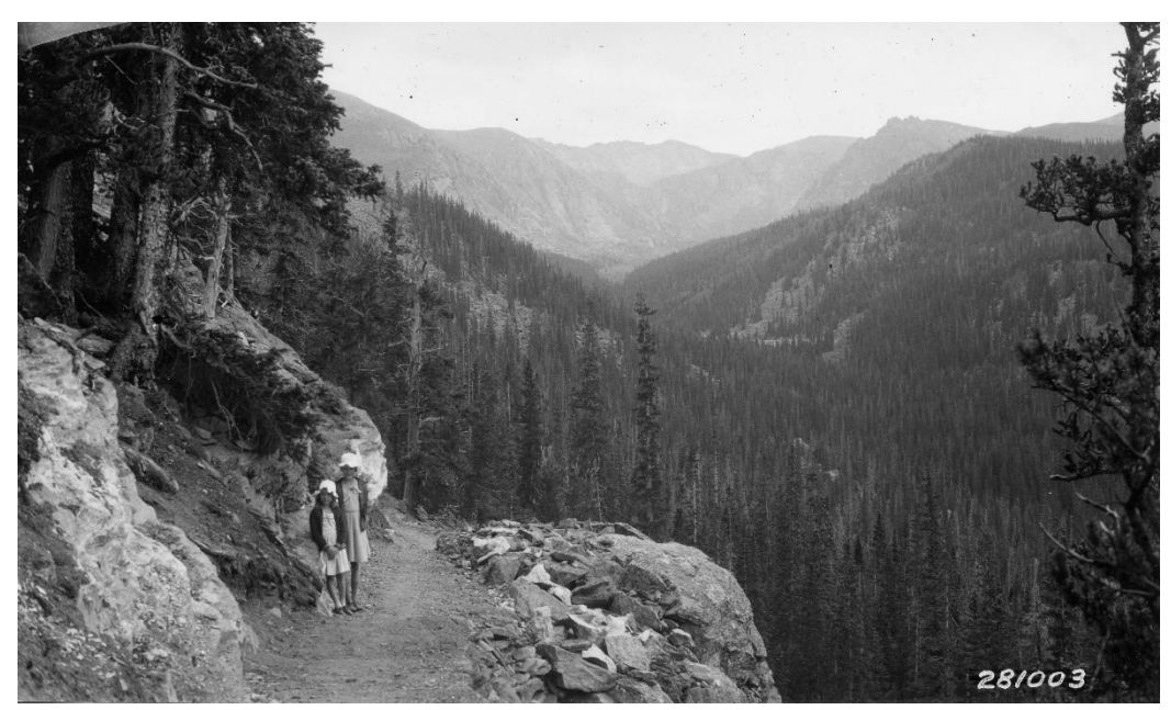
1933 - Two young girls on the newly-constructed trail from Echo Lake to Idaho Springs Reservoir.

Idaho & Chicago Creek Wagon Road Co. was incorporated in early April, 1870 with the intent to build a road up Chicago Creek from Idaho Springs to the lakes but, fortunately, this either never reached the lakes or there no longer is any trace of the effort.